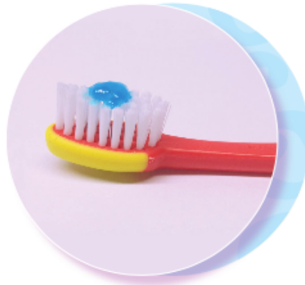
Use a pea-size amount for children ages 3 to 6.

..... This handout was prepared by the National Center on Early Childhood Health and Wellness under cooperative agreement #90HC0013 for the U.S. Department of Health and Human Services, Administration for Children and Families, Office of Head Start.