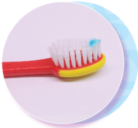
Use a smear for children under age 3.