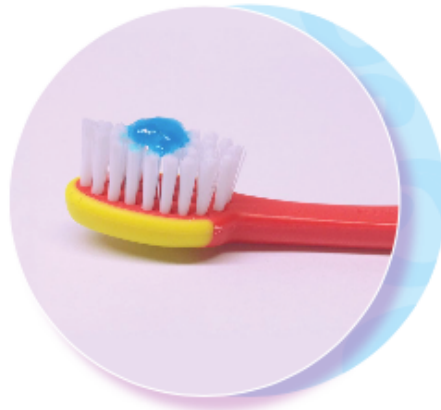
Use a pea-size amount for children ages 3 to 6.

..... This handout was prepared by the National Center on Early Childhood Health and Wellness under cooperative agreement #90HC0013 for the U.S. Department of Health and Human Services, Administration for Children and Families, Office of Head Start.